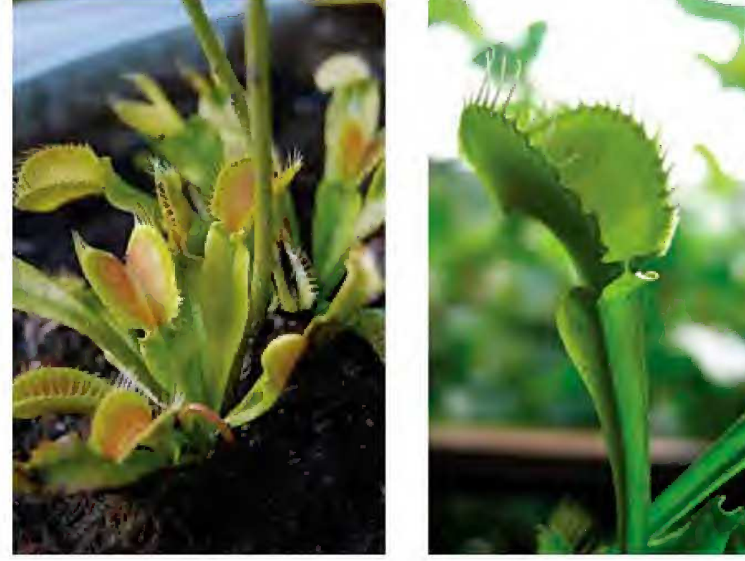
Figure 1: Dionaea 'Korrigans' plant.

I have given the name Korrigans to this Dionaea because of the fusion between the petiole and the trap. Korrigans, here in Brittany, are little strange characters who have a human top of the body fused with animal legs. On this Dionaea cultivar, the trap part, which could fancifully be thought of as animal-like, is fused with the more mundane and vegetable-like part – the petiole.